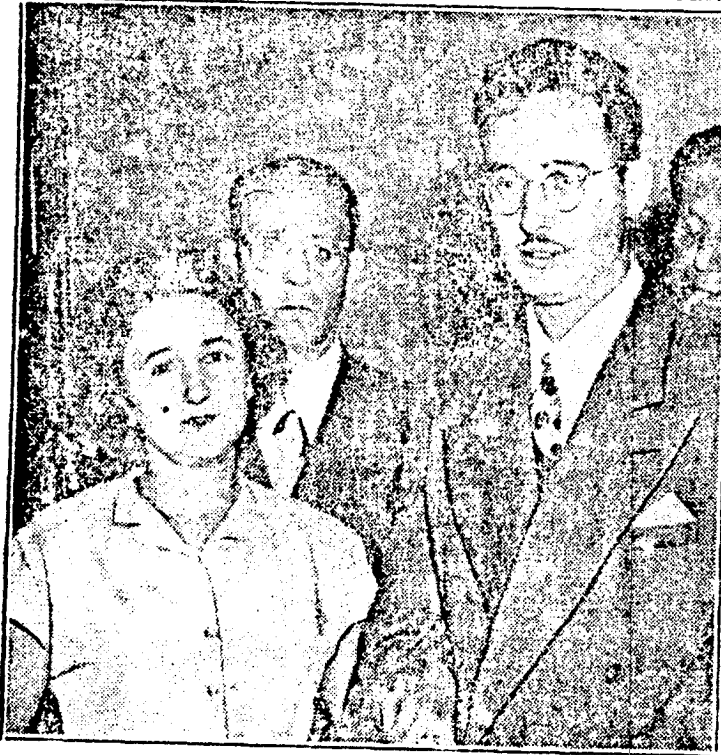
Julius and Ethel Rosenberg during trial.

The death penalty imposed on Julius Rosenberg and his wife Ethel for stealing atomic secrets for the Soviet Union